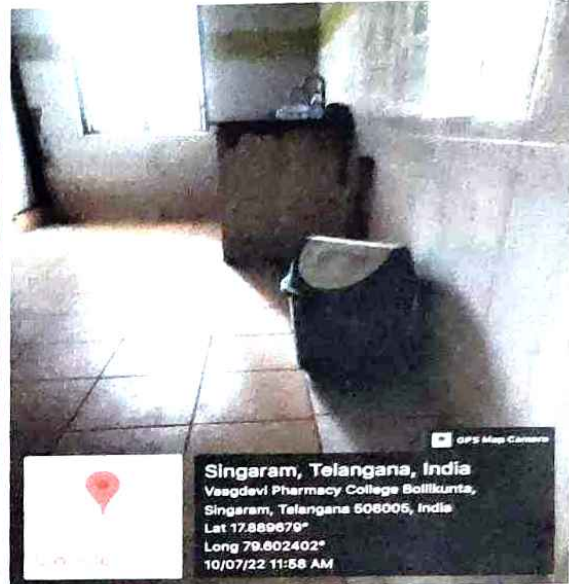
Solid Waste Management